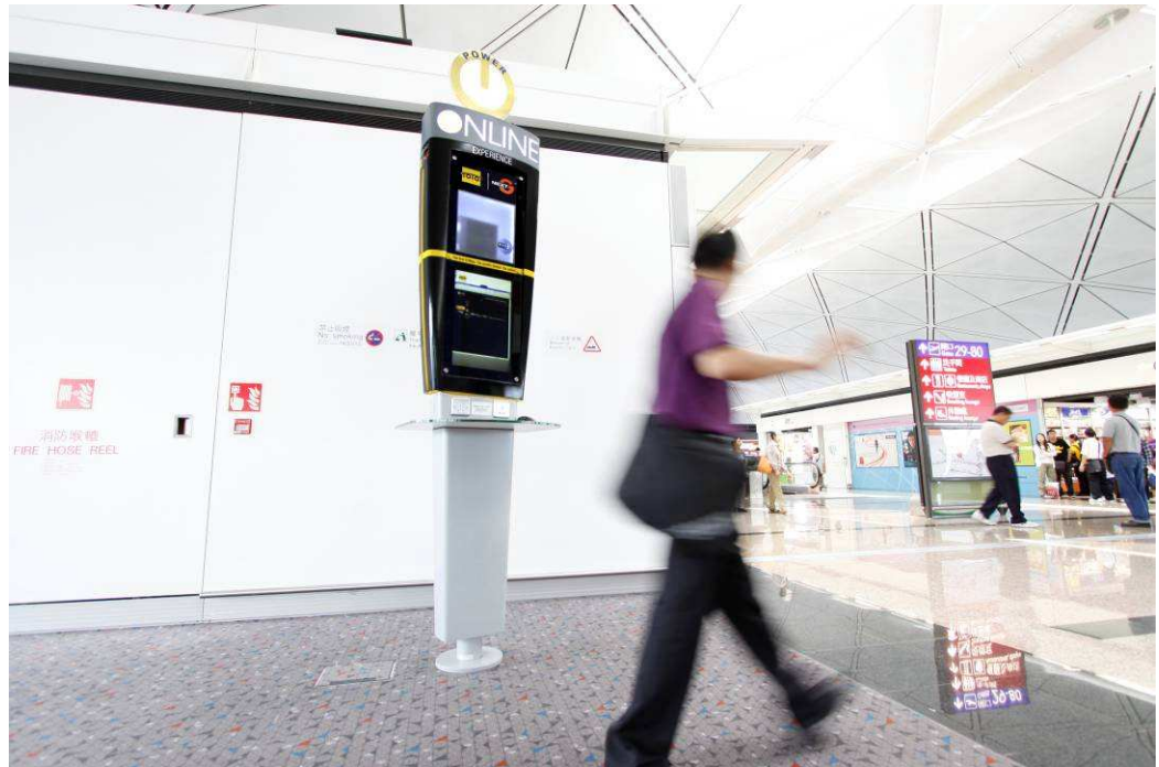
The first Power Pole at Hong Kong International Airport (Located at Departure Central Concourse)